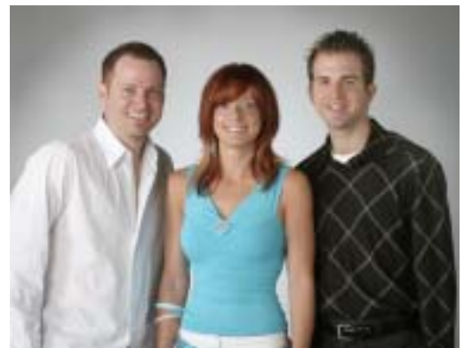
NCA's 2004 FALL/WINTER COLLECTION DESIGN TEAM